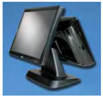
Optional Integrated 15" Rear LCD Customer Display (NCC Reflection POS for Windows)