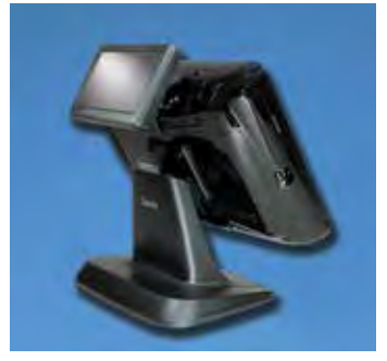
Optional Integrated 7" Rear LCD Customer Display (NCC Reflection POS for Windows)