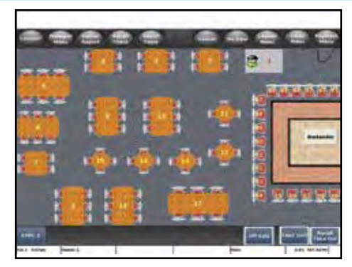
Customized graphical table maps.