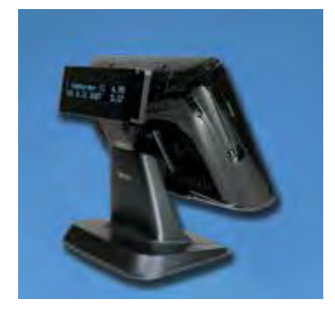
Optional Integrated Rear VFD Customer Display