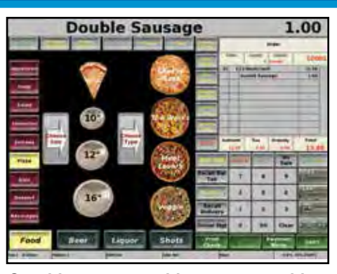
Graphic screens guide operators with minimal training.

The NCC Reflection POS delivery module will allow guest checks to be created and assigned to customers for delivery. NCC Reflection POS can maintain a customer file of 9,999 entries which can be accessed and sorted by customer ID number, phone number, address, first and last name or by city. NCC Reflection POS can create and store new customers on the fly during a first time purchase. When used with PC WorkStation NCC Reflection, POS can automatically retrieve order history allowing for fast and accurate order entry. Guest checks created for delivery are