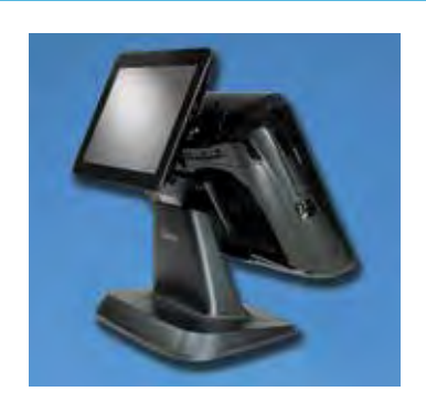
Optional Integrated 9.7" Rear LCD Customer Display (NCC Reflection POS for Windows)