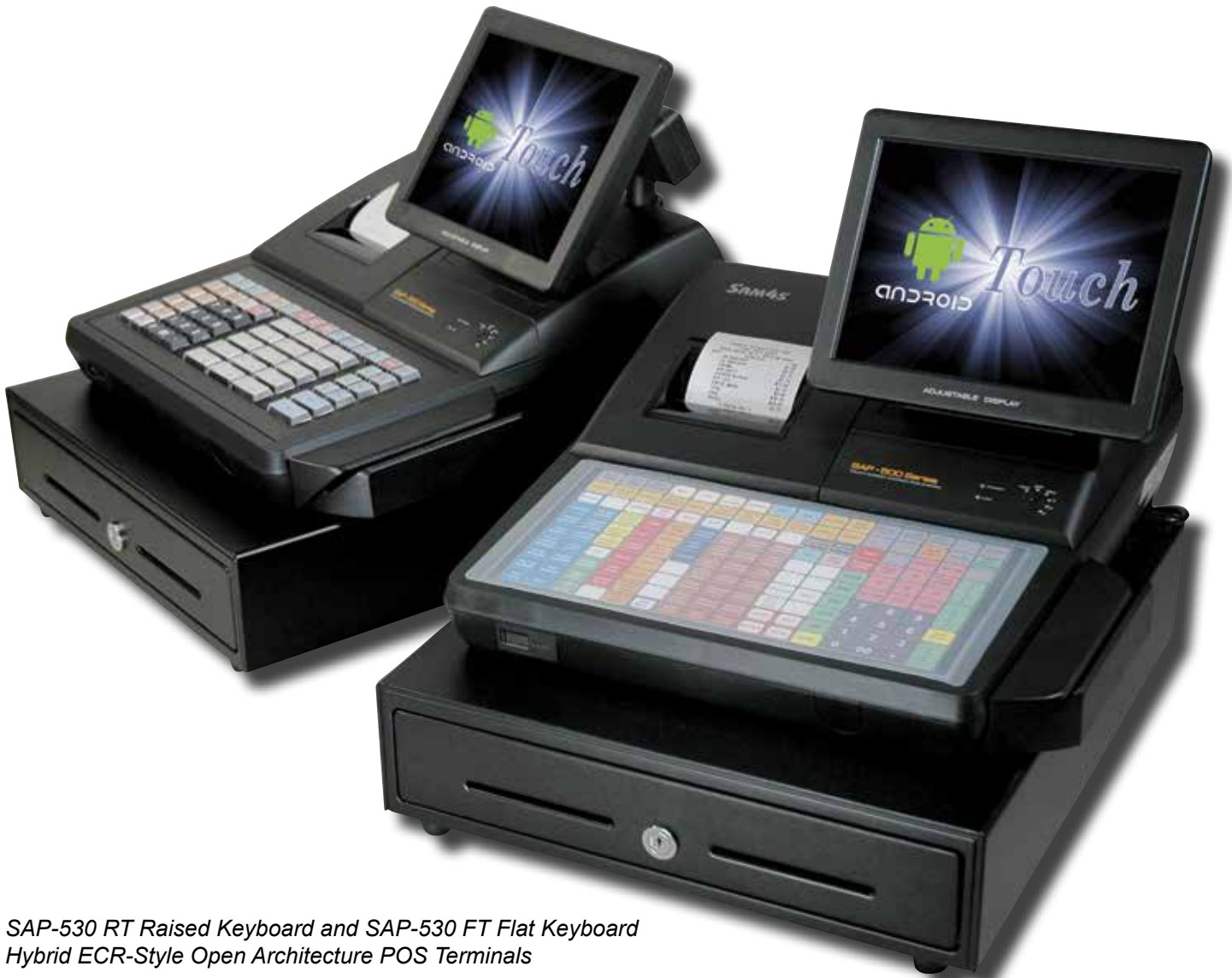
SAP-530 RT Raised Keyboard and SAP-530 FT Flat Keyboard Hybrid ECR-Style Open Architecture POS Terminals

Hybrid ECR-Style Open Architecture POS Terminals